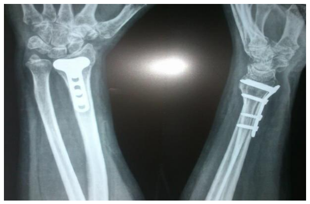
Figure 3: Post op x ray showing union

The results of radiological evaluation revealed that on the final follow up, our patients achieved 9.61 mm mean radial length, 4.22° average volar tilt and 21.53° of average radial inclination.