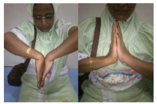
Figure 4: Post op picture showing ROM

In 14 patients (38.90%) fracture got united within 10 weeks of time. The range of union time varied from 6 weeks to 14 weeks. The average mean for the sample of 36 patients worked out to be 9.53 weeks. Out of 36 patients, 1 patient (2.80%) required implant removal because of pain due to longer screw at dorsum of wrist.